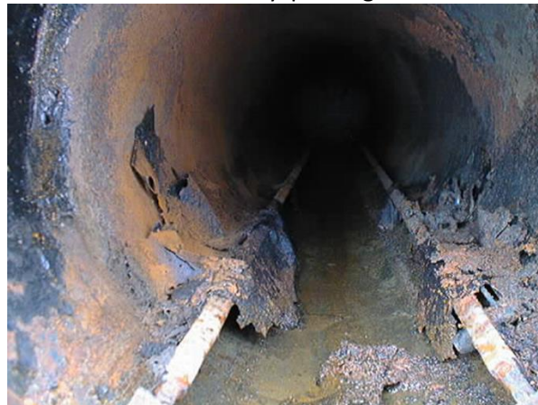
Leaking HCl Cylinder in 5502 ERCV after 1 year

Securing the ERCV properly to the vehicle is another common problem. Many users mistakenly believe the brakes will hold it in place during shipment. Serious damage has occurred during transit