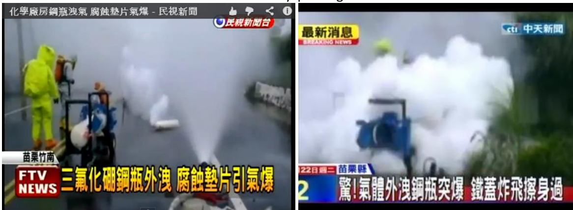
BF 3 Cylinder Containment, Taiwan Jan 2013

In Jan 2004 a Fab ER Team used a new 5502 ERCV to contain a ClF 3 cylinder that they didn't realize had the valve wide open. Use of an ERCV for strong oxidizers like ClF 3 is prohibited by the procedures since the ERCV cannot be cleaned and passivated. As the flange was being closed the ClF 3 immediately started to react with the O Rings and Seal. The ER Team panicked and pushed it out into the parking lot where the leaking ClF 3 liquid proceeded to burn a hole through the carbon steel. The reaction was so hot that it charred the epoxy paint.