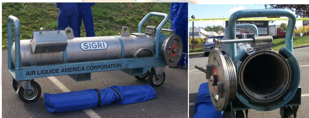
Sigrí ERCV, Model TG-168

In the early 1980's two ERCV's designed by Sigrí Elektrographit, GmbH, a German Company used flange closures that were easier to operate in an emergency, in addition the larger vessel was mounted on a moveable cart. The small unit, TG-12 (13.7 liters) had a screw cap that was easily tightened using a handle and the larger TG 168 (188 liter) had a breach closure. These were designed to TUV pressure vessel specifications and met the requirements of the Hazardous Goods Regulations for Road Transport GGVS/ADR of leaking gas cylinders in Europe.