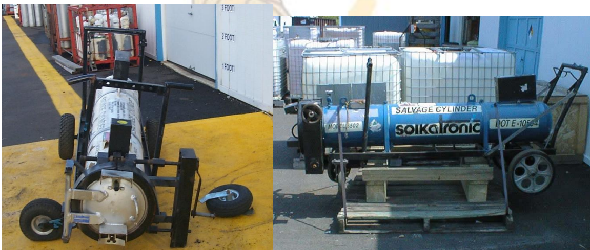
Damaged ERCVs from Transport

Securing the ERCV properly to the vehicle is another common problem. Many users mistakenly believe the brakes will hold it in place during shipment. Serious damage has occurred during transit