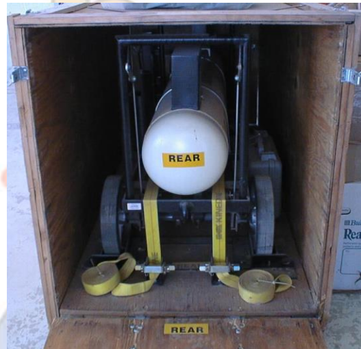
ERCV In Air Cargo Crate

To support our customers and ER teams worldwide a custom built 5502 ERCV enclosed in a aircraft suitable shipping crate was located in the Phoenix warehouse that could be airfreighted anywhere in the world.