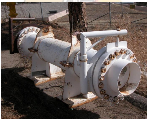
Typical Site ERCV

ERCVs were originally designed and fabricated by gas suppliers or users for site use over 50 years ago. Each were custom designed by/for the user. They were expensive, difficult to use and difficult to move. To legally transport the leaking gas cylinder in the US, an emergency exemption had to be applied for after the cylinder was contained. This process could take months for approval and in the meantime the cylinder would continue to leak into the ERCV before it could be moved from the site. This increased the potential for the ERCV to leak. This also tied up the ERCV so it would not be available for another emergency.