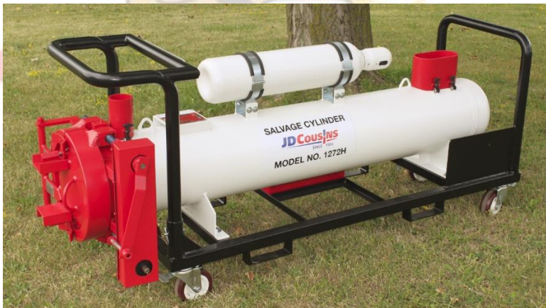
JD Cousin 1272H ERCV

In 2021, JD Cousins and Chemically Speaking LLC introduced the 1272H.