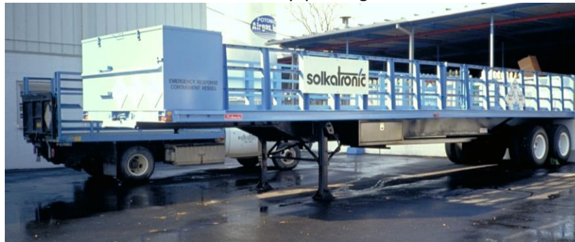
ERCV Enclosure on Cylinder Trailer

To support our customers and ER teams worldwide a custom built 5502 ERCV enclosed in a aircraft suitable shipping crate was located in the Phoenix warehouse that could be airfreighted anywhere in the world.