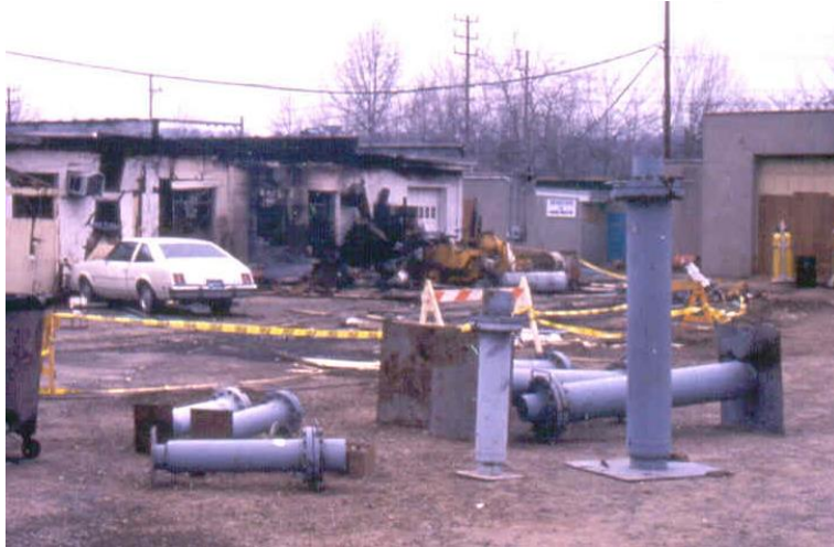
ERCV's Used By NJ DEP after Gollub Explosion 1988

In the early 1980's two ERCV's designed by Sigrí Elektrographit, GmbH, a German Company used flange closures that were easier to operate in an emergency, in addition the larger vessel was mounted on a moveable cart. The small unit, TG-12 (13.7 liters) had a screw cap that was easily tightened using a handle and the larger TG 168 (188 liter) had a breach closure. These were designed to TUV pressure vessel specifications and met the requirements of the Hazardous Goods Regulations for Road Transport GGVS/ADR of leaking gas cylinders in Europe.