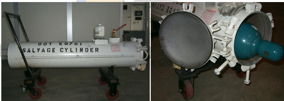
Chlorine Institute ERCV

During this time, the Chlorine Institute also developed a low pressure ERCV in 1988 for use on 150 lb Chlorine Cylinders. This has a pressure rating of 250 psig. The exemption E9781 only authorized its use for Chlorine. Exemption E10987 however extended the use to any gas with a pressure less than 250 psig