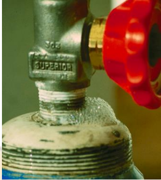
Bubbler Leak 0.1 – 10 cc/min

Not likely, outside of a catastrophic failure (rupture) of the cylinder such as due to a severe physical impact it will take some time for the gas to leak out of the cylinder. In the rare event of a leak during use it would be very small, in the order of 0.1-10 cc/min. (Bubbler)