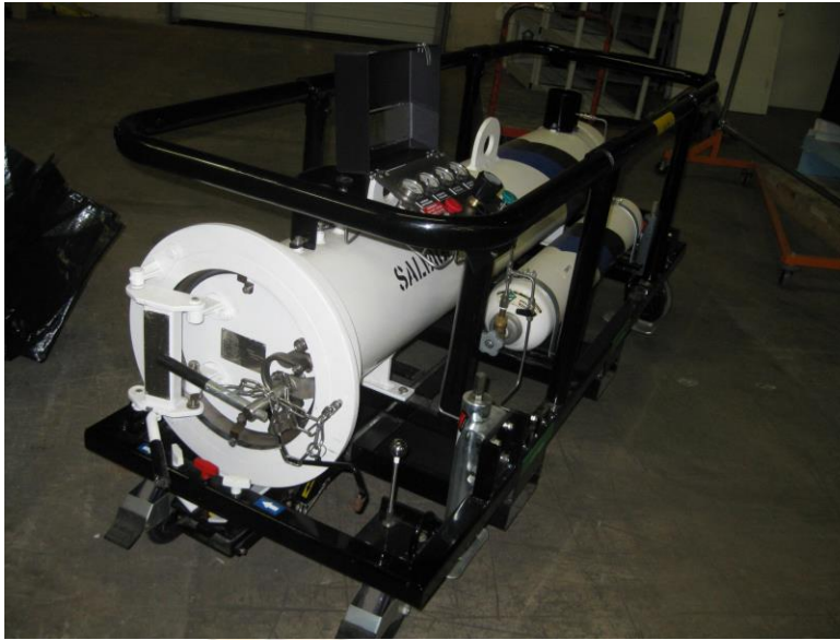
IES HP-10 ERCV