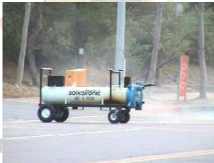
ERCV With ClF 3 Liquid Reacting With Carbon Steel

In Jan 2004 a Fab ER Team used a new 5502 ERCV to contain a ClF 3 cylinder that they didn't realize had the valve wide open. Use of an ERCV for strong oxidizers like ClF 3 is prohibited by the procedures since the ERCV cannot be cleaned and passivated. As the flange was being closed the ClF 3 immediately started to react with the O Rings and Seal. The ER Team panicked and pushed it out into the parking lot where the leaking ClF 3 liquid proceeded to burn a hole through the carbon steel. The reaction was so hot that it charred the epoxy paint.