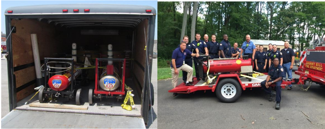
FDNY ERCV and Cherry Hill FD ERCV

All ten of the Taiwan EPA funded regional Chemical Emergency Response Teams have a 5502 ERCV.