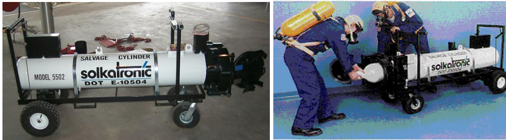
Solkatronic ERCV, Model 5502

Since that time over 400 units, primarily model 5502, by Solkatronic have been sold to gas companies, users, waste disposal companies and government agencies worldwide. A larger model 5503 was developed in 2003 for the larger diameter industrial grade low pressure Chlorine and Ammonia cylinders. Air Products and Chemicals acquired Solkatronic Chemicals Inc in 1998 and continues to supply and support the ERCV business.