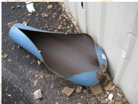
Fig. 1: Overfilled Trifluoromethane Cylinder

Liquid expands with increasing temperatures as well as the vapor pressure. It could expand to completely fill the cylinder (liquid full).