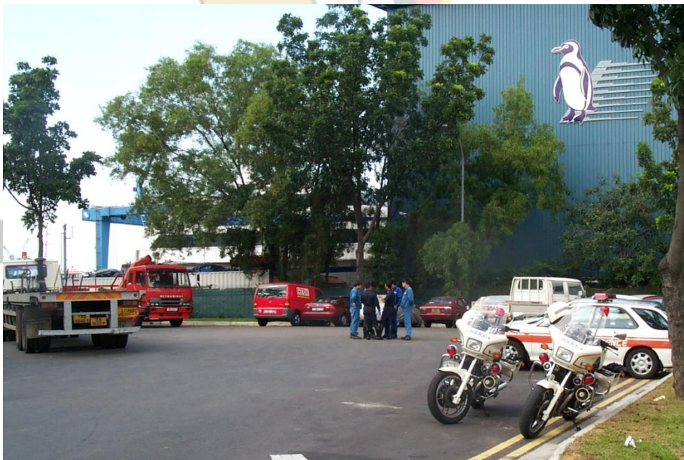
Fig. 2: Vehicles and Teams Preparing for Delivery at Gas Supplier

The delivery truck with the Fire Proof Enclosed ERCV was in the middle of a parade of vehicles. It was led by 2 motorcycle policemen, followed by a SCDF ER Vehicle, the truck and then the gas supplier ER Vehicle!